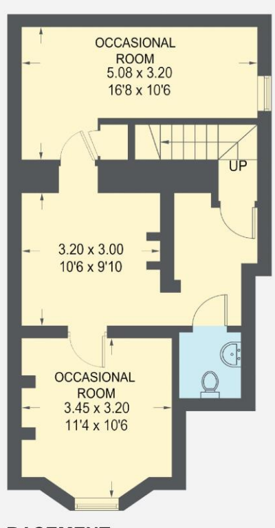
BASEMENT 51.5 SQ M / 554 SQ FT

APPROXIMATE GROSS INTERNAL AREA = 136.9 SQ M / 1473 SQ FT BASEMENT = 51.5 SQ M / 554 SQ FT TOTAL = 188.4 SQ M / 2027 SQ FT