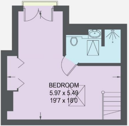
SECOND FLOOR 29.3 SQ M / 315 SQ FT