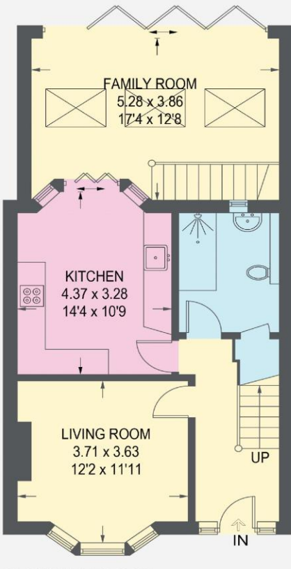
GROUND FLOOR 64.8 SQ M / 697 SQ FT